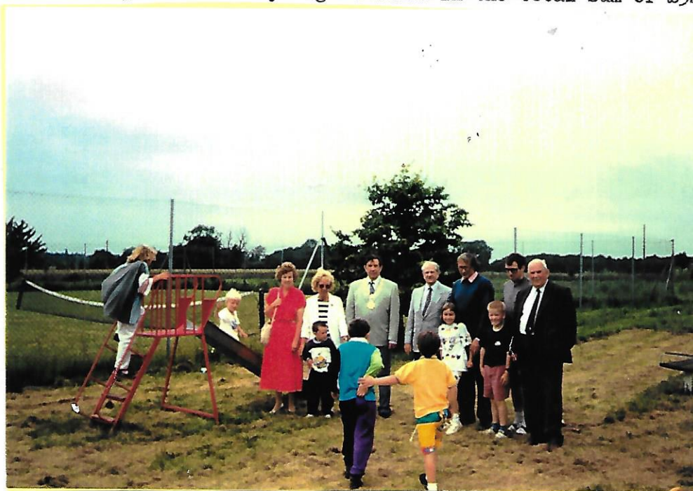
Official Opening 26th June 1993