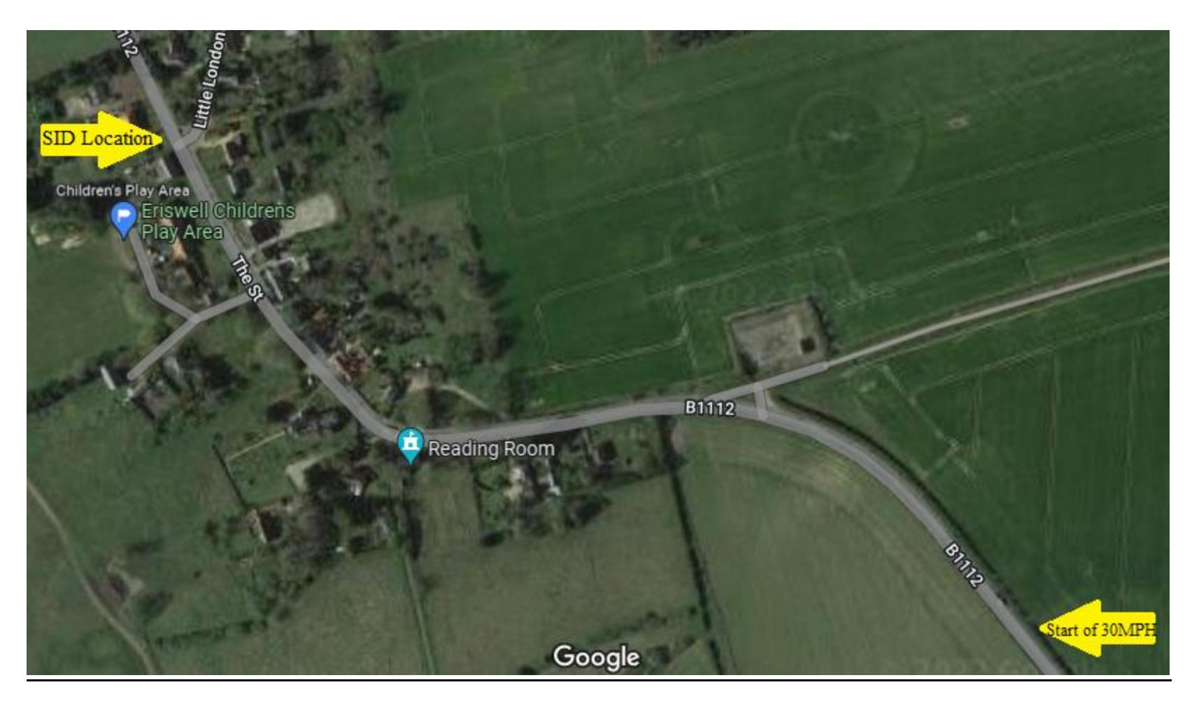
SID Location vs Start of 30MPH zone