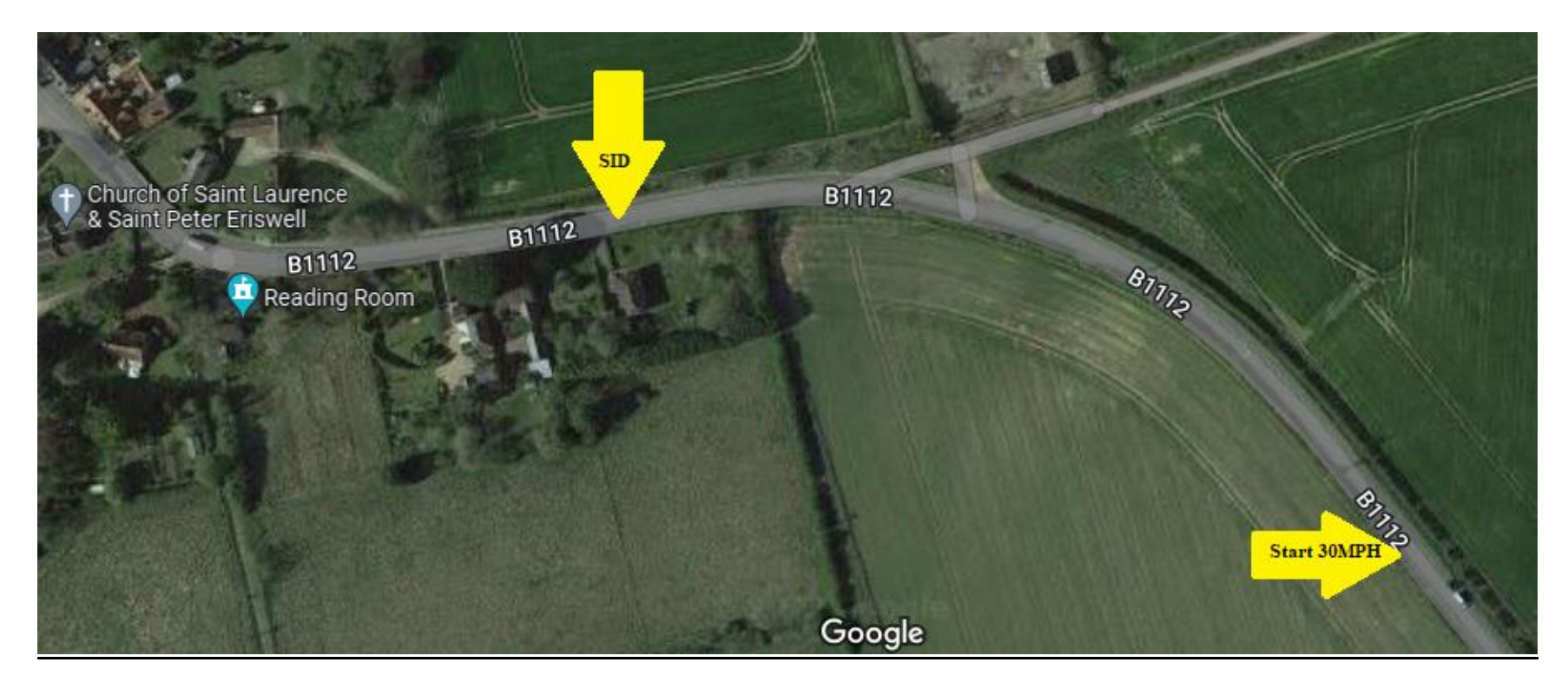
SID Location vs Start of 30MPH zone