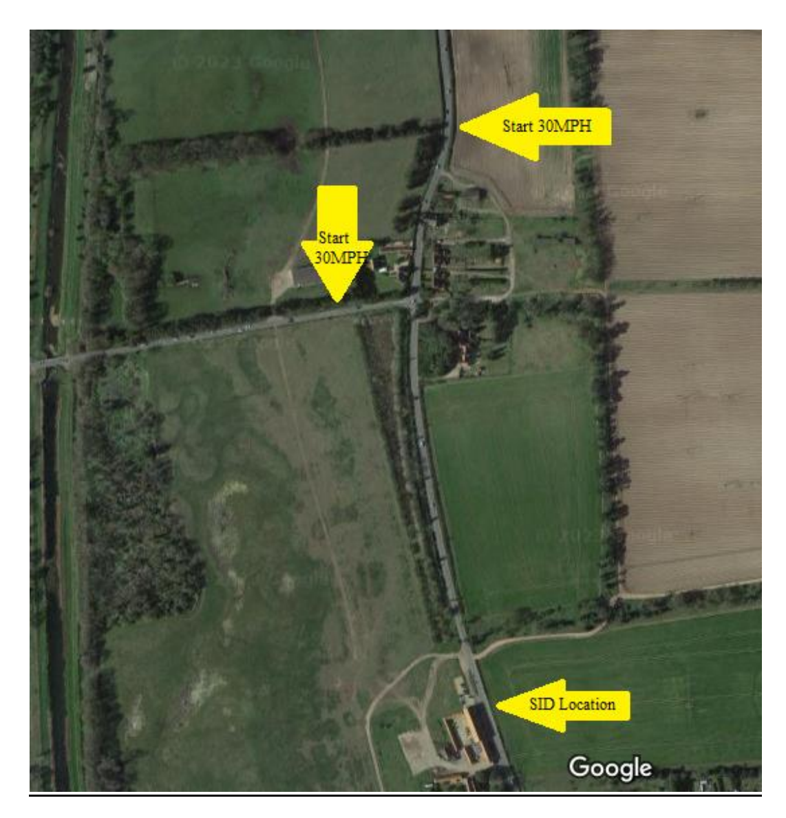
SID Location vs Start of 30MPH zone