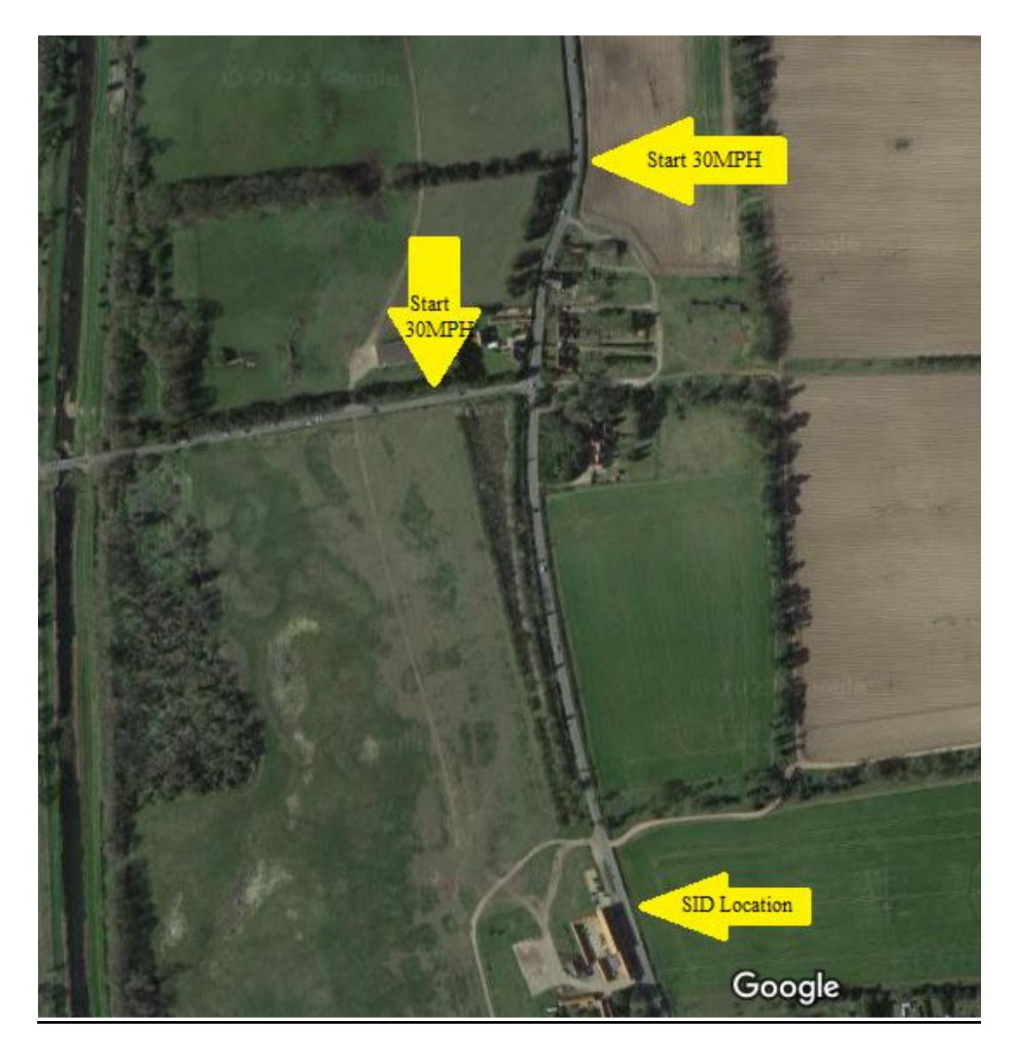
SID Location vs Start of 30MPH zone